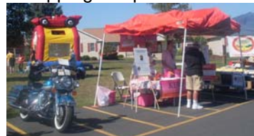
"Cruisers for Christ Car Show"

teachers and school mates at "Back to School Night" at RLCA. We had a great time at the car show - ever try convincing to a bunch of men looking at old cars and motorcycles to buy a "Shopping Coupon"?