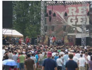
"Revelation Generation 2008"

We had a long and busy day at the Brandywine Arts Festival in Wilmington and we had an opportunity to bring awareness of the Kamp to the lunch crowd at Chick-fil-A in Bear, from 11 to 1. The most memorable event was RevGen. This amazing 2 day Christian Concert hosted over 15 national bands and more than 30,000 people.