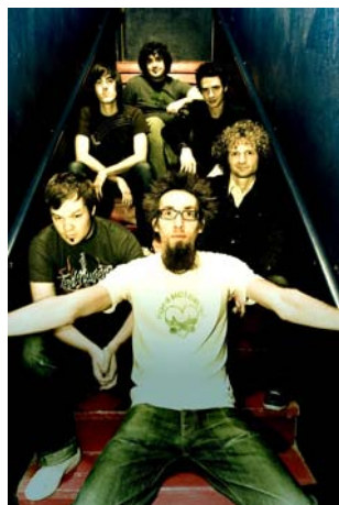
The David Crowder Band