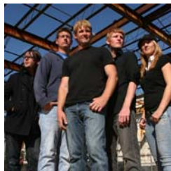
Sum of One