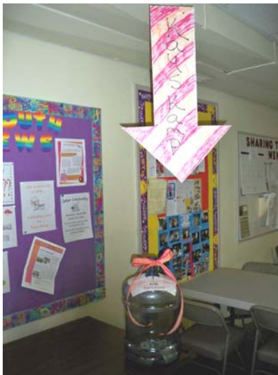
St. Georges UMC Youth Group